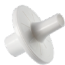
Spiro protect bacterial filter (200 pcs.)