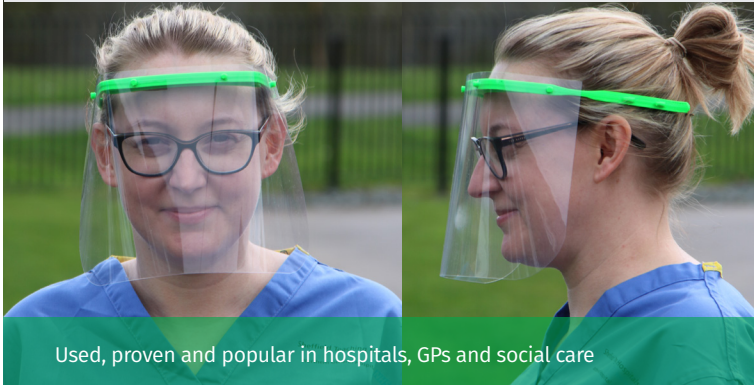
Used, proven and popular in hospitals, GPs and social care