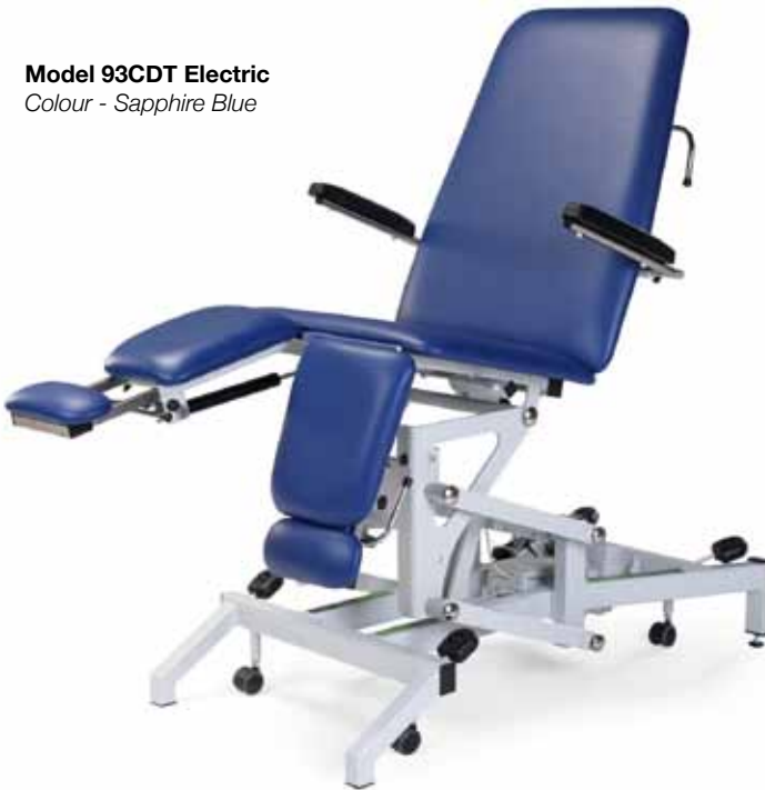
Model 93CDT Electric Colour - Sapphire Blue

This model features electric operation of height and tilt facility with manually adjustable backrest and individually adjustable leg rests to aid positioning of the patient for podiatry procedures. The backrest has auto levelling armrests to provide support and comfort to the patient in sitting positions. The backrest and leg sections can also be adjusted to fully support the patient in prone or supine positions for biomechanics or other procedures. A wide range of options are available to personalise the couch for various procedures and to meet individual user requirements.